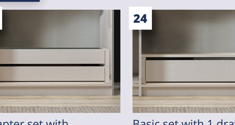
Basic set with 1 drawer, Adapter set with low, and 1 cover panel