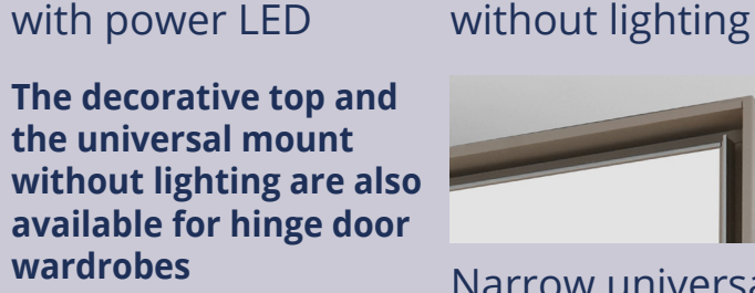
Narrow universal Narrow universal mount with mount without