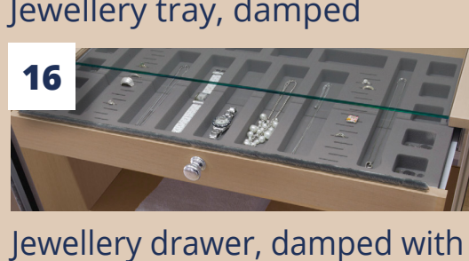
protective glass plate