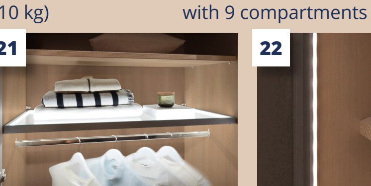
Illuminated glass shelf