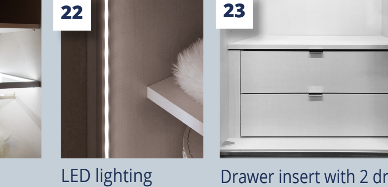
Drawer insert with 2 drawers and larger frame, soft-close function as standard (in Decor Texline only)