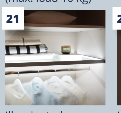
Illuminated laundry baskets interior mirror glass shelf