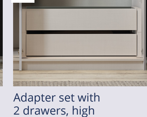
high, and 1 cover panel

extended in terms of height. They are delivered with a soft-